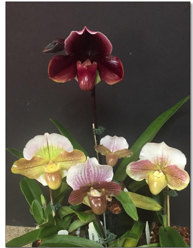
Miniature vs Standard Paphiopedilums