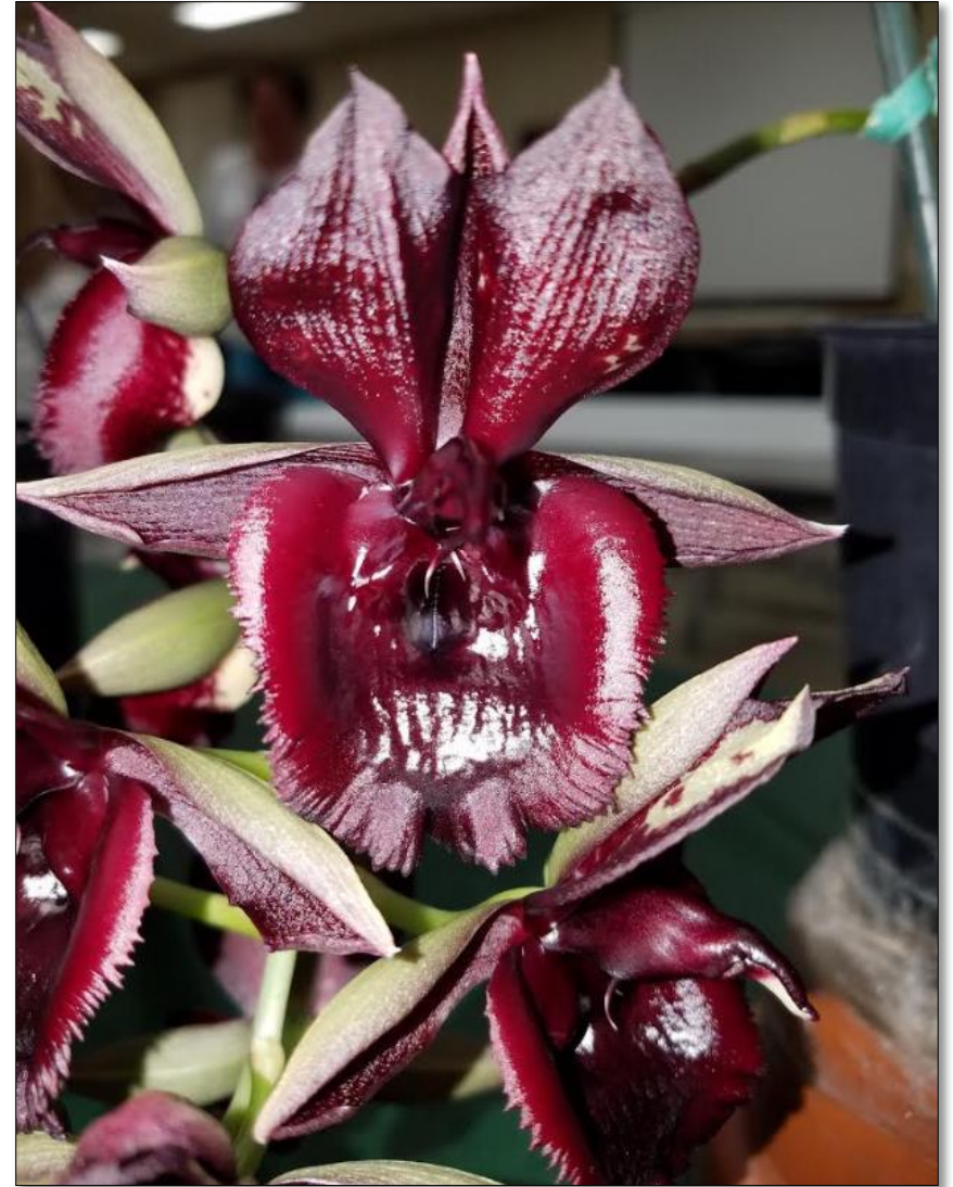
Ctsm. Dark Odyssey 'SVO Black Cherry' AM/AOS Exhibited by Fred Clarke Awarded AM/AOS 85 points