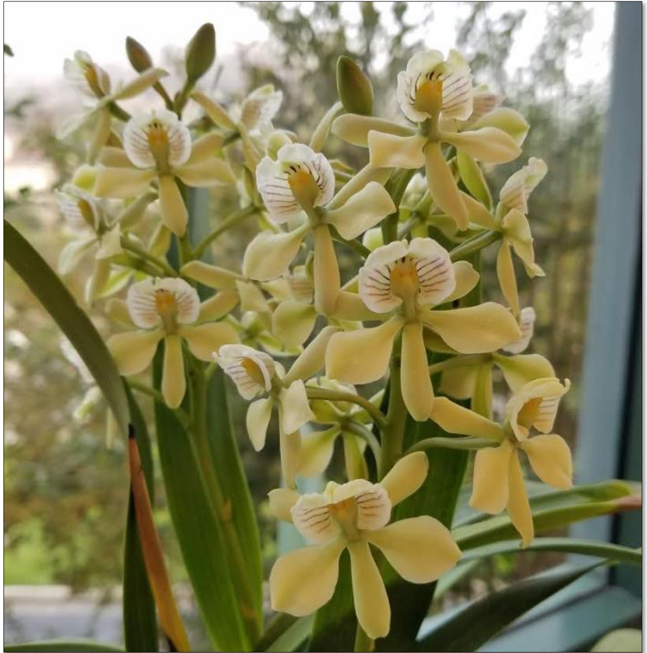
Prosthechea radiata