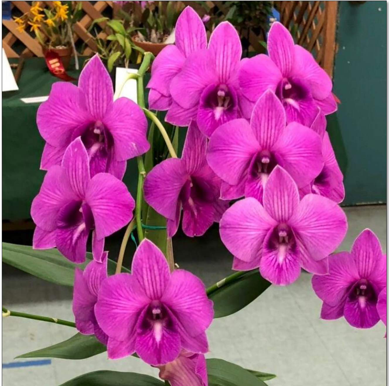
Dendrobium Dang Klang