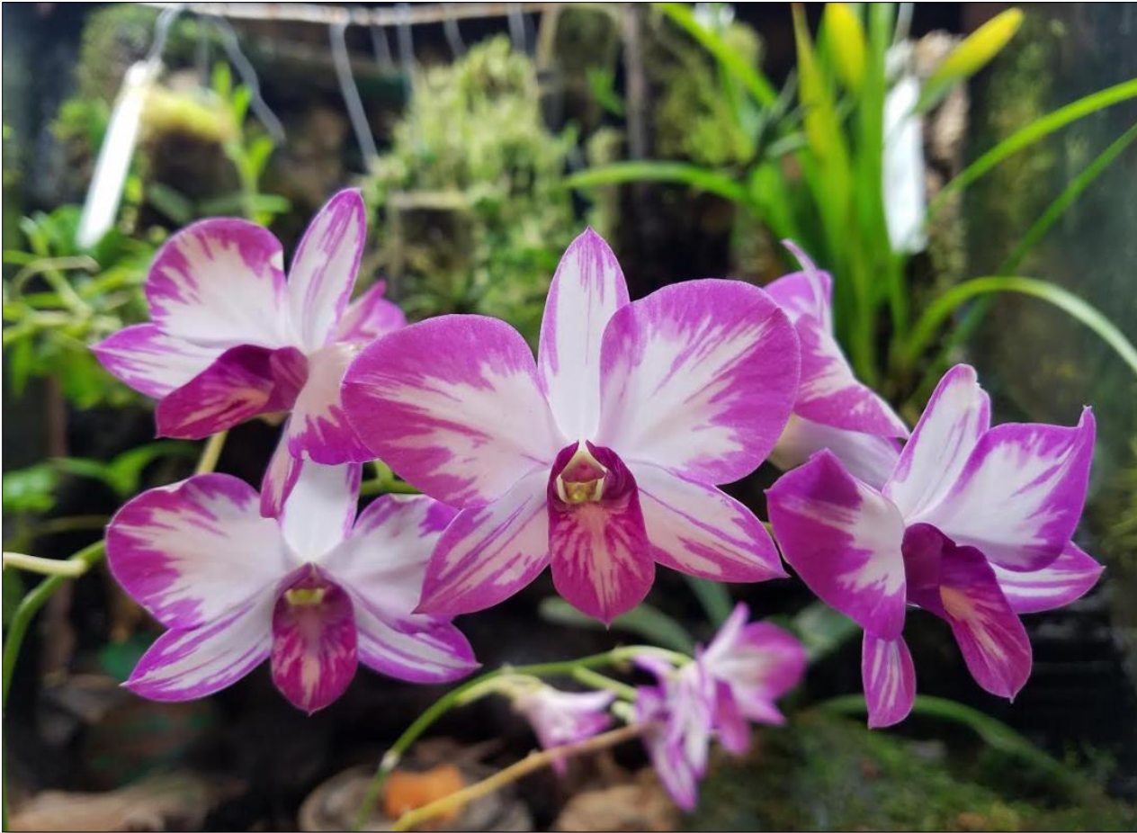
Dendrobium Enobi "Purple Splash"