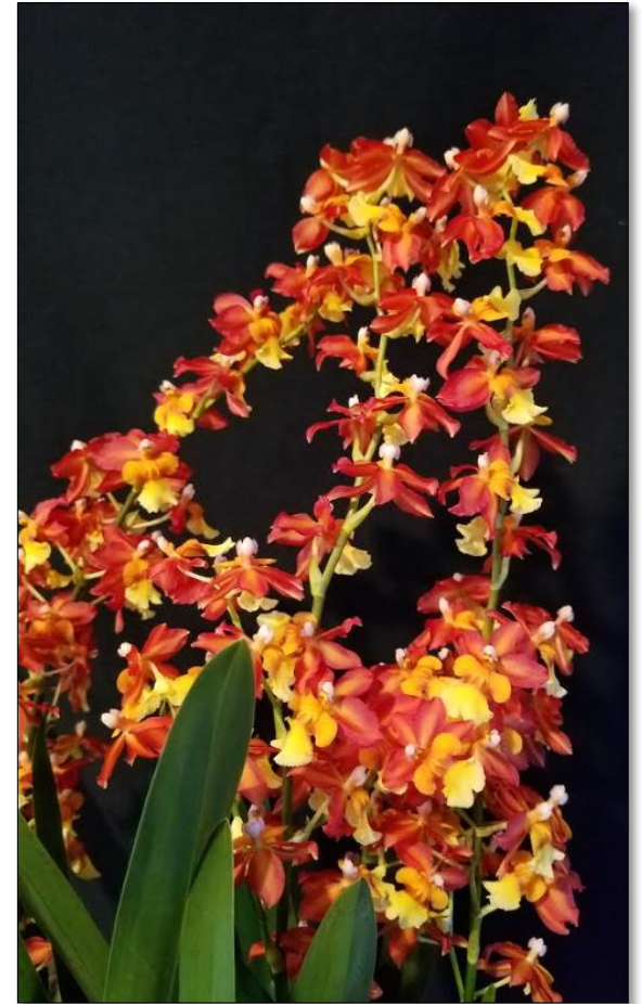
Wilsonara ENA "ENA Sib"