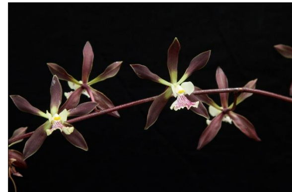
Encyclia Cynthia x E. Ginger Snap