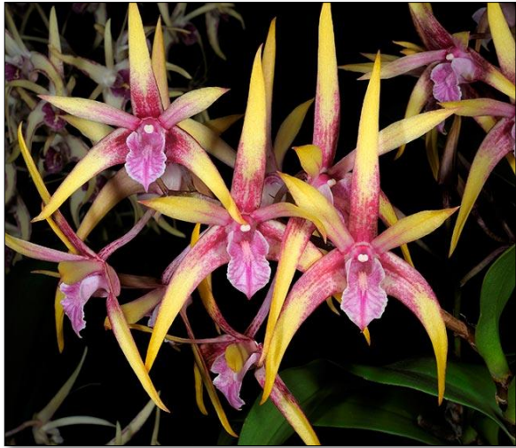
Den. Regal Gillieston 'SVO'