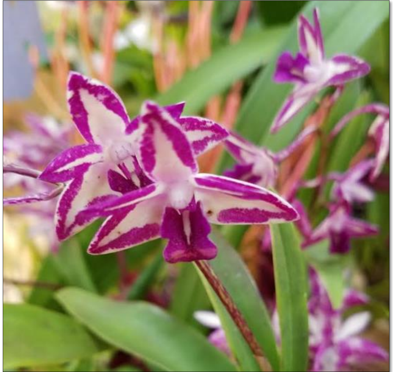
Dendrobium King Zip 'Red Splash'