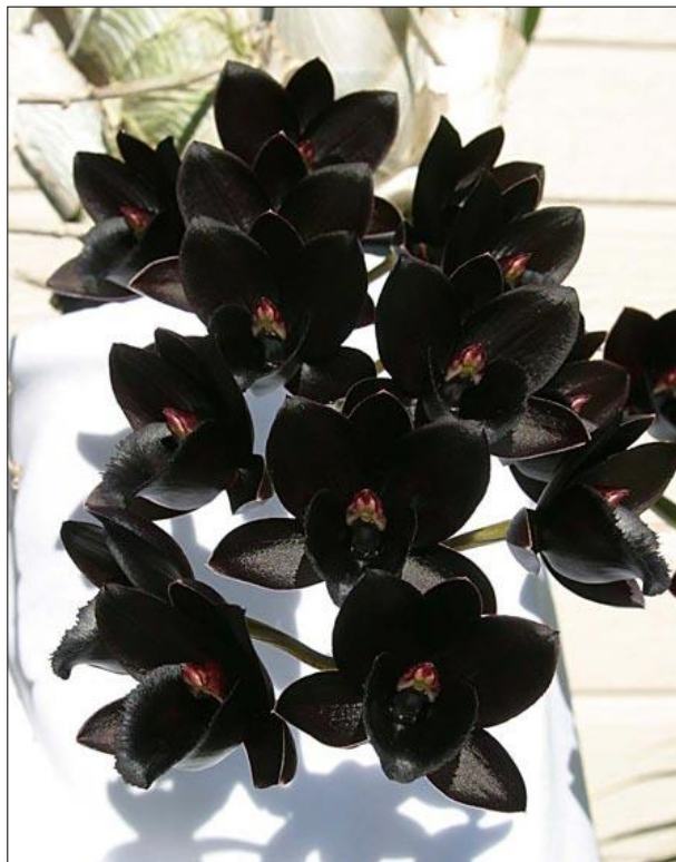
FDK After Dark 'Black Diamond' FCC-AOS

Bring your notebooks. This is going to be a very interesting meeting!