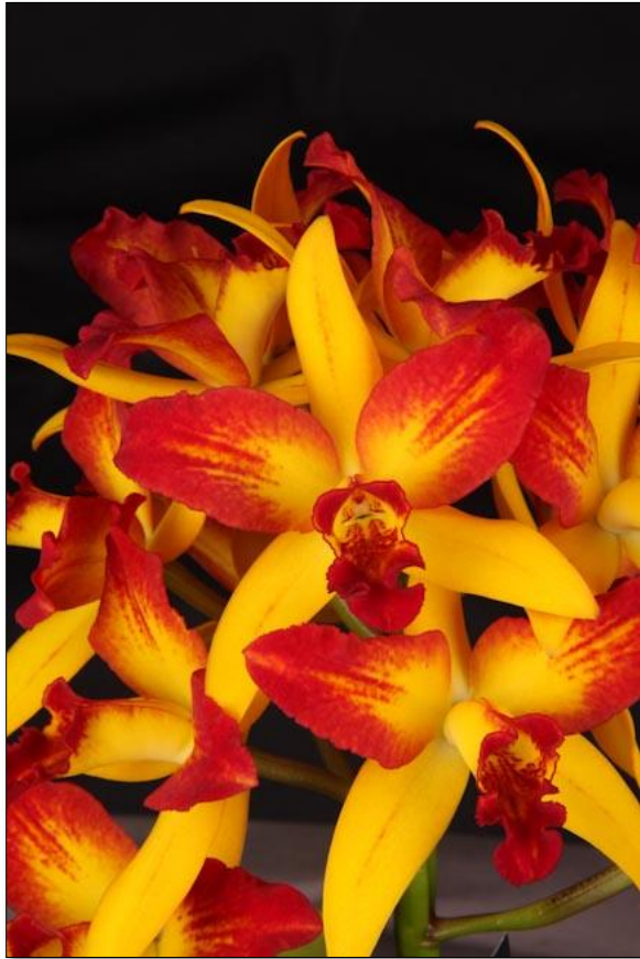
B/c. (Rth.) Laughing Boy 'Sunset Valley Orchids' AM

This month's culture class will address an important topic for all of us who grow orchid plants. Kay Klausing will teach us about vapor pressure deficit (VPD) and why this is one of the most important factors in orchid culture, whether you live near the ocean or in the East County. Vapor pressure deficit is a