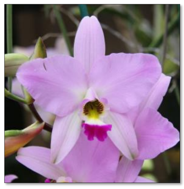
L. anceps 'Sanbar Pink Perfection'