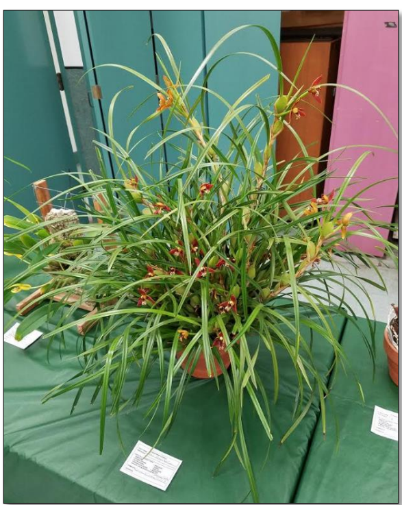
Maxillaria tenuifolia Plant