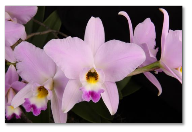
L. anceps 'SanBar Pink Persuasion'