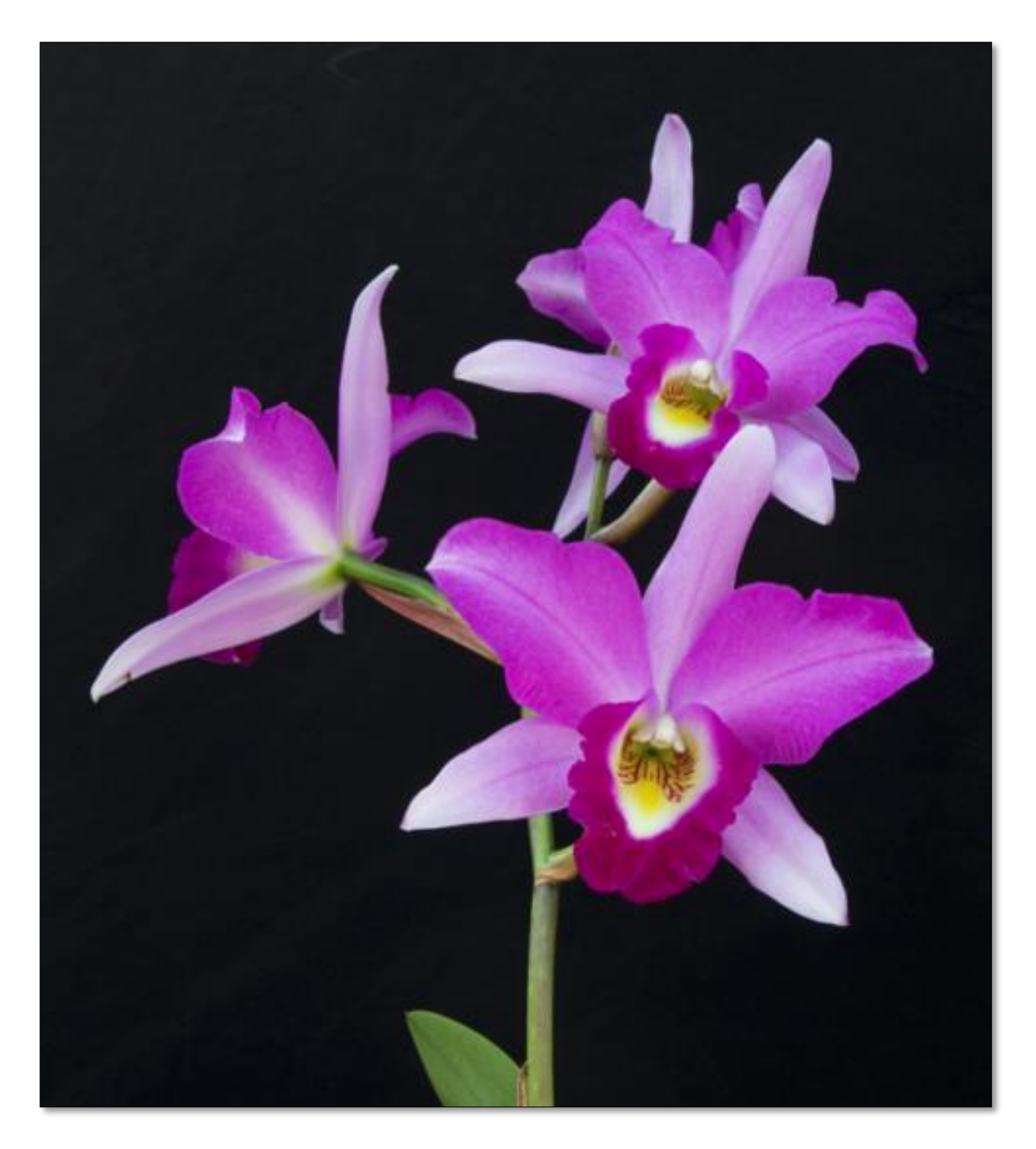
Slc. Tropical Song 'Tango' x L. anceps 'Marble Queen'