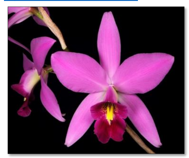
Laelia anceps 'San Bar Summit'