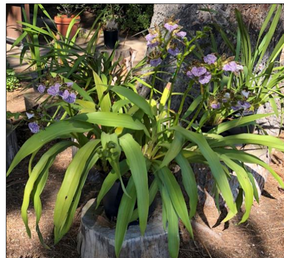
Some Zygopetalum / hybrid