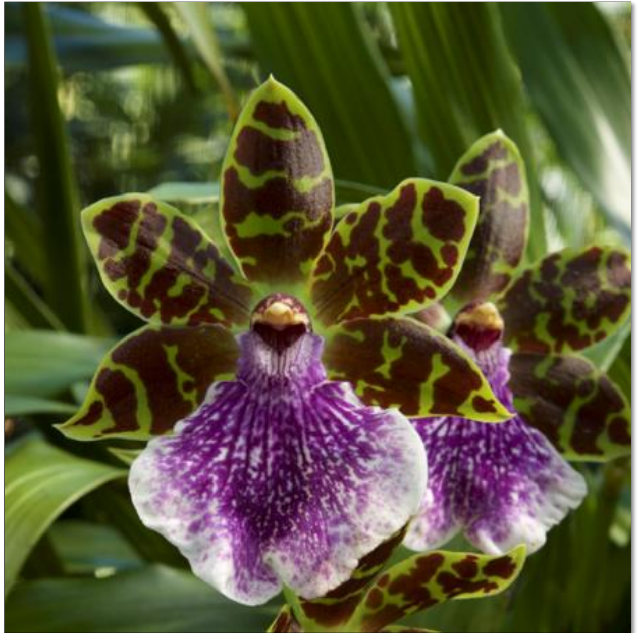
Z. Kiwi Korker x Pbt. Copper Queen