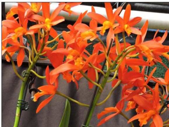
Ctt Trick or Treat. Plant by Bruce Berg