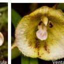
Dracula lemurella (L), Lepanthes escifera (R) La Selva de Ventanas Reserve, Colombia

We hope you will join us in promoting this important work. We invite you to become a member of the OCA, to make a donation, to take a trip with us to see Orchids in the Wild®, and to purchase merchandise through our website. Since we have no paid staff, all proceeds support orchid conservation. The OCA is a non-profit 501(c)(3) corporation.