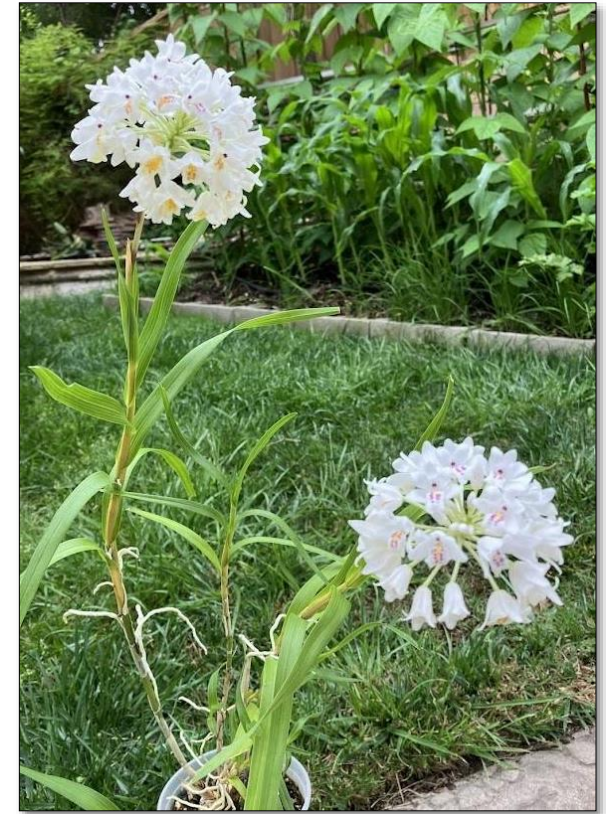
Neobenthamia gracilis Min Teng

After that, he will discuss an "Overview of Growing Orchids in Various Settings" - this will be part of a series of growing orchids in various settings like terrarium, outdoors, greenhouse etc.