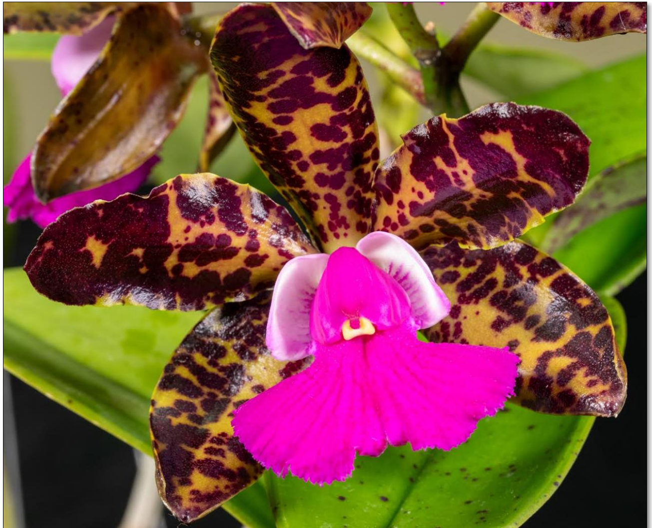
Cattleya Lacy Michelle Matherne Sunset Valley Orchids

Please remember: judging starts promptly at 6:30, so please have your plants in before then.