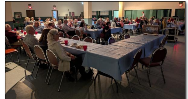
SDCOS Spring Banquet