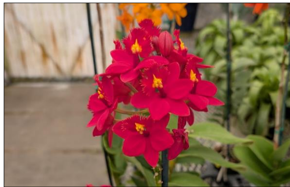
Epidendrum hybrid Cal Orchid