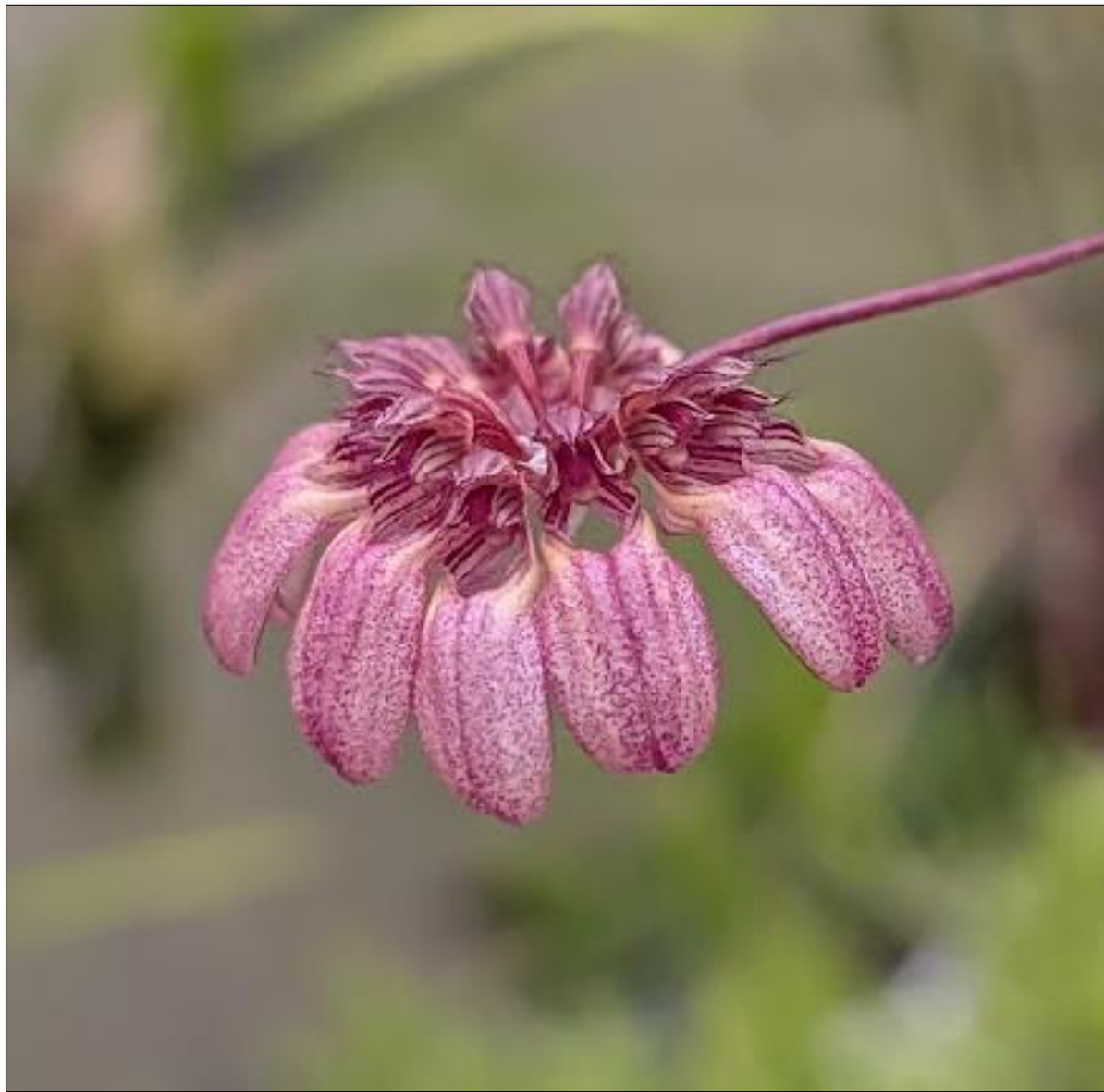
Bulbophyllum sp Lisa Humphries