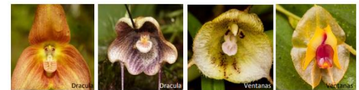
Dracula gigas (L), D. trigonopetalata (R) Dracula Reserve, Ecuador

The OCA conserves orchids by funding habitat preservation. Since inception in 2005 we have helped with the purchase of over 3000 acres of orchid habitat, protecting hundreds of orchid species in Brazil, Ecuador and Colombia. Many species of rare birds, trees, frogs, mammals also find refuge in these reserves.