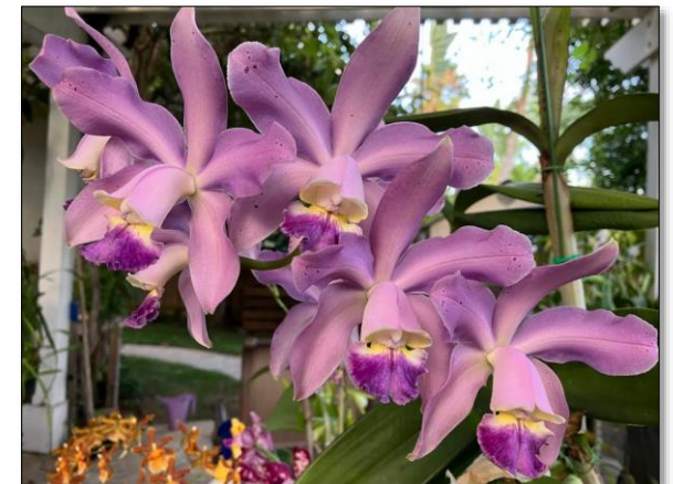
Cattleya Gaudii Min Teng