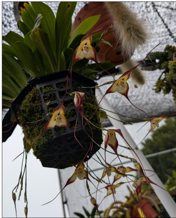
Dracula sp.