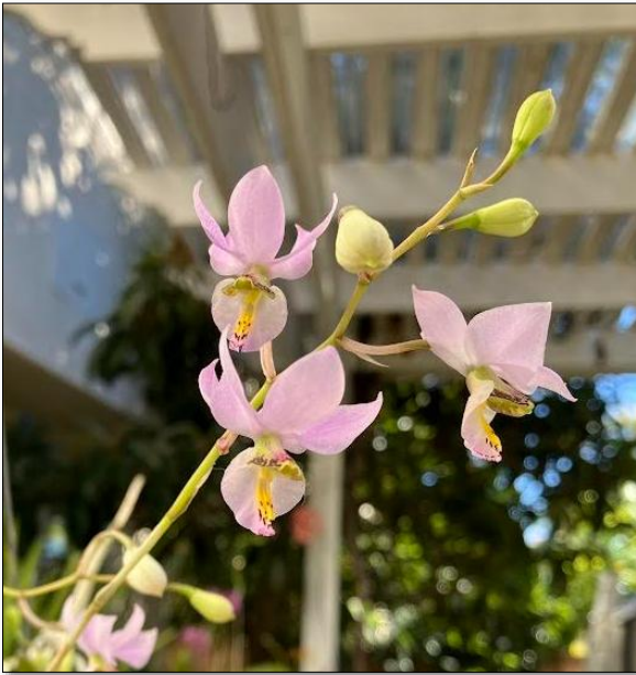
Barkeria whartonianana