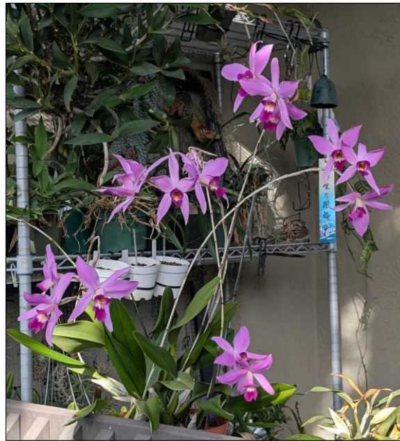
Laelia anceps

Any of these roles can be taken on a trial basis. Please consider stepping into one.