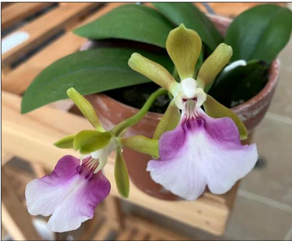
Trichocentrum albococcineum Min Teng