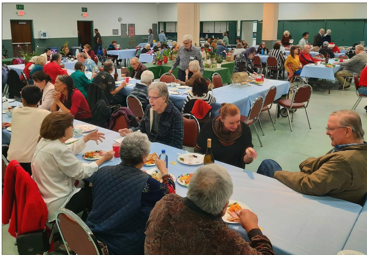
SDCOS 2025 Holiday Party