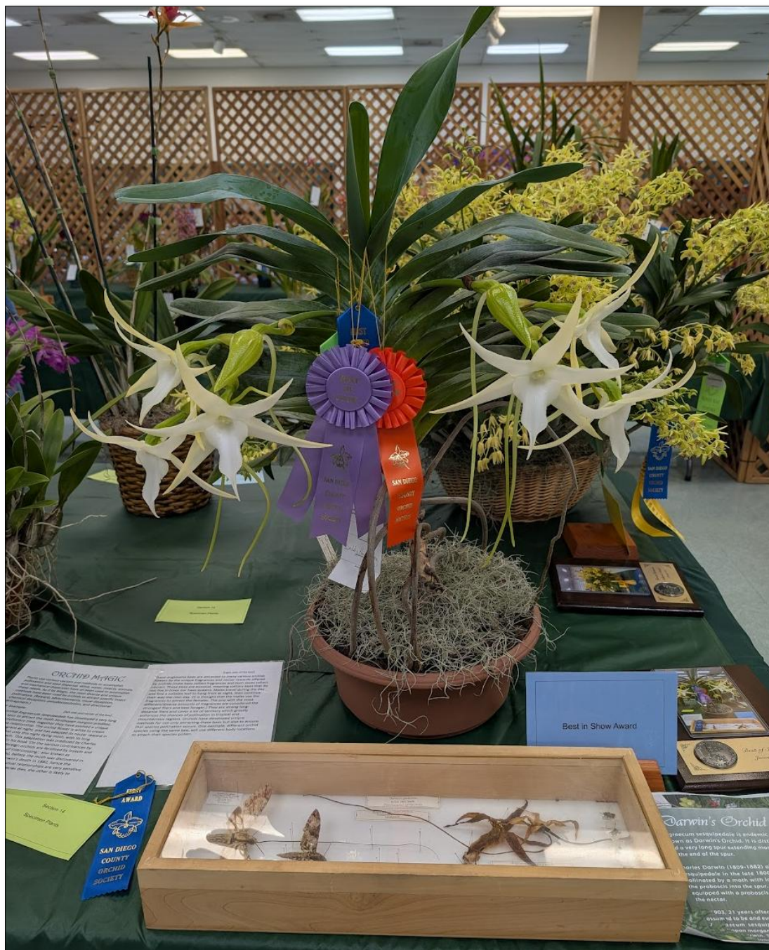
Angraecum sesquipedale Best In Show, January 2026 Debby Halliday

Please note: more January Show articles and pictures will be in the March Newsletter