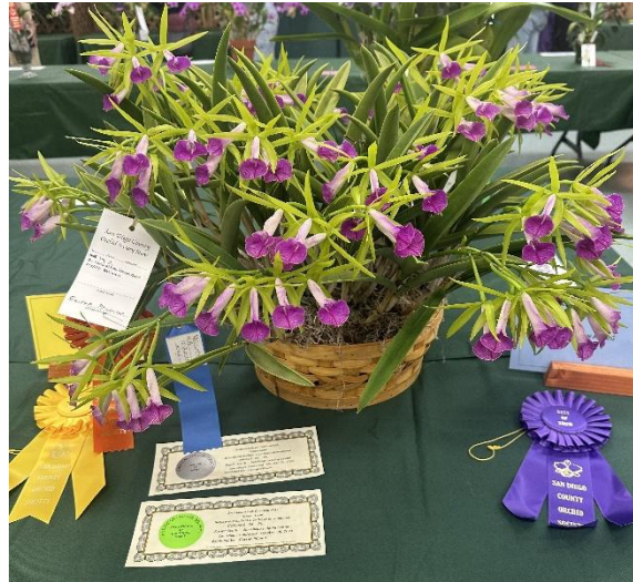
Brassocattleya Gulfshore's Beauty 'Green Gem' (syn. Carnival Kids)