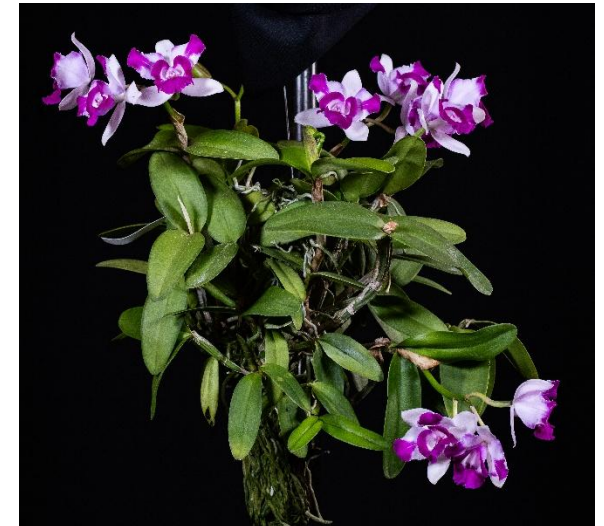
Cattleya intermedia perlorica marginata 'Courtland'