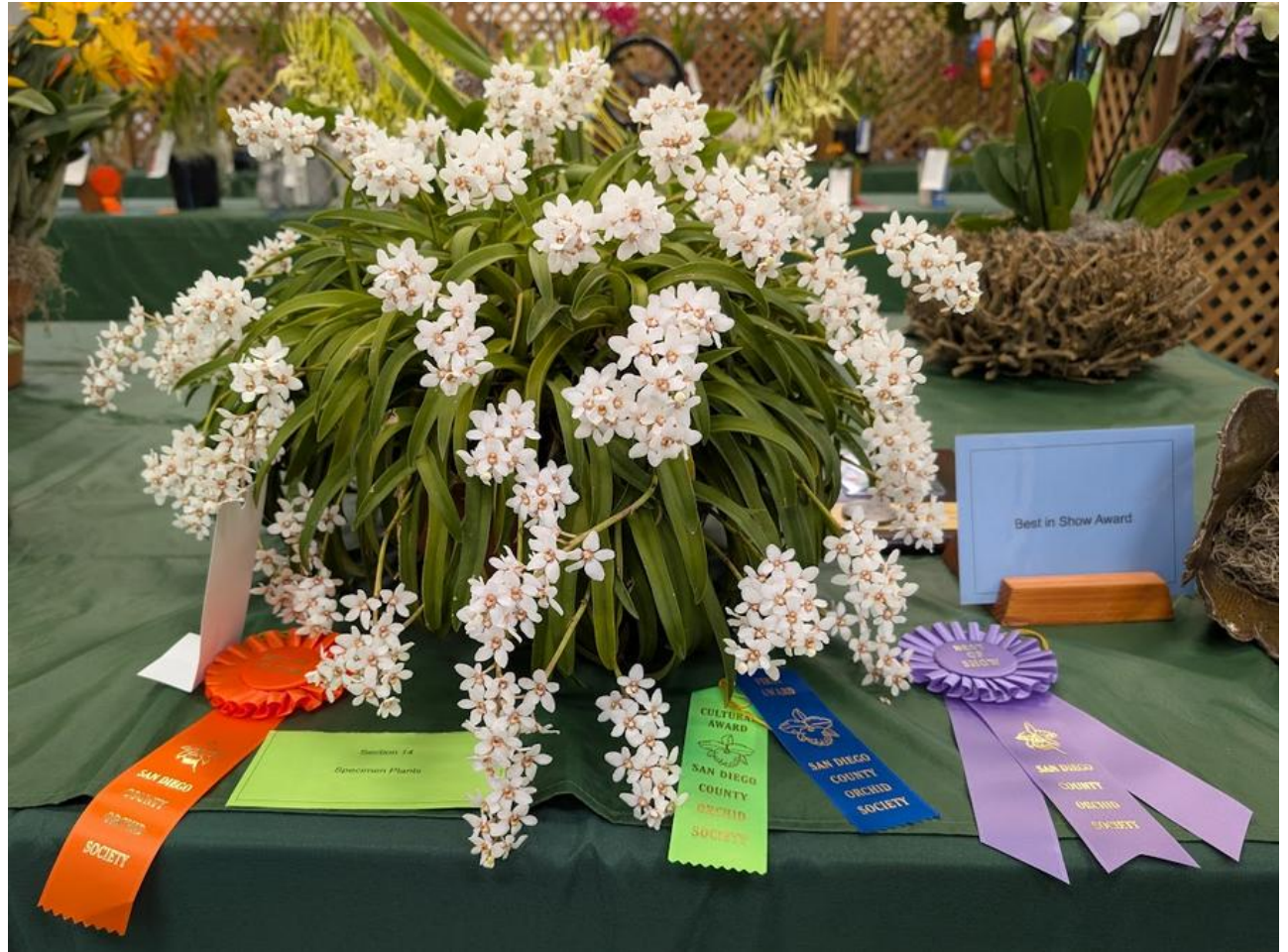
Sarcochilus hartmannii Best of Show Tom Biggart